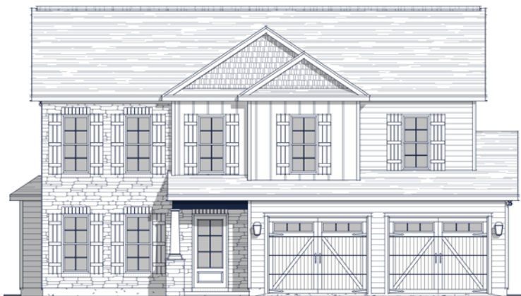
4 3'-0" WIDER GARAGE W/ TWO DOORS